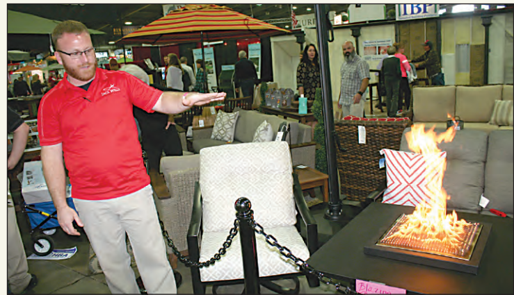
JACK WILLS: A representative of Jack Wills Outdoor Furniture demonstrates the "Blazing Beats," a dancing outdoor fire pit complemented by its own music. Jack Wills, with locations in Tulsa and Springdale, Arkansas, offers outdoor furniture, grills, play sets and fireplaces.